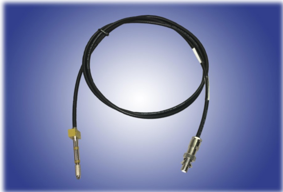
Figure 1 HVP-CX-3 probe holder for 3kV coaxial measurements

Probe holder for high voltage applications. The HVP-CX-3 comes with a SHV connector and coaxial cable for up to 3kV operation. A needle vise at the tip of the holder holds needle securely by an easy twisting operation.